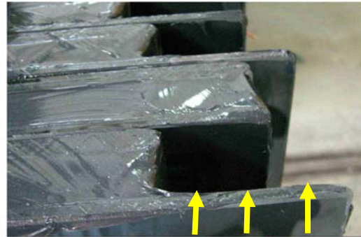
If this Off-set area is low-e coated then the coating must be deleted in its entirety over the exposed area and back to at least 50% through the width of the primary sealant path.

Failure to delete the entire off-set surface area could result in long term coating failure in the off-set area. This coating failure could affect the seal in the frame and/or become visually objective as viewed from the outside.