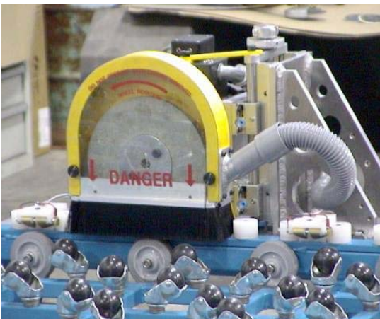
Photo of Deletion Wheel and Dust Collection Enclosure on a Table Deleter.

Regardless of the deletion process used, the equipment must be equipped with a collection system that includes a HEPA filter and/or the operators and persons in the vicinity may be required to wear appropriate respirators. For additional information, refer to the Environmental, Health, and Safety Statement below and to the Sungate and Solarban Coated Glass Material Safety Data Sheet available from Vitro Technical Services.