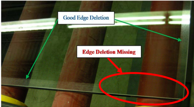
Photo at Left shows an area with incomplete edge deletion. Edge deletion needs to be complete around the entire periphery of the glass. In laminated glass applications where the coating is in contact with the interlayer material, and in all commercial glazing applications, edge deletion of the coating is required for the coating warranty to be valid.