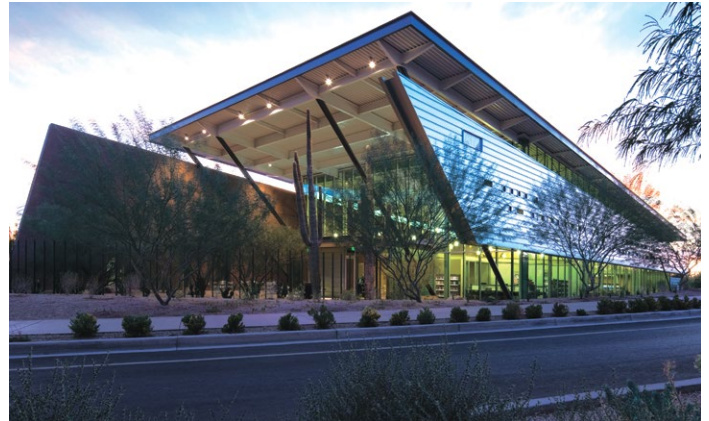
DURANAR® VARI-Cool® coatings by PPG Industrial Coatings shift from dark green to silver to mauve, depending on light conditions and viewing angle.

Not surprisingly, the library's desert home made water efficiency and site sustainability top priorities. A former parking lot on the property was restored to support the natural desert habitat, including native and dry climate plantings that require no mowing, watering or fertilization. Stormwater drains from the roof to replenish the arroyos, where plant life is more abundant. Inside the building, highly-efficient fixtures cut water consumption by 53 percent compared to conventional libraries.