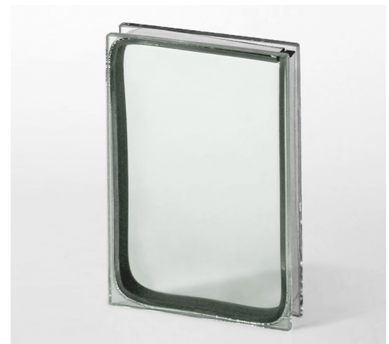
Solarban® 60 Starphire® Glass

Amazon Spheres | Seattle, Washington | Solarban® 60 Starphire® Glass | Architect: NBBJ | Vitro Certified® Fabricator Glazing Contractor: Enclos | Photographer: Bruce Damonte