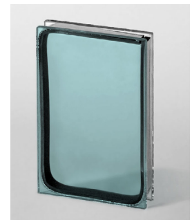
Vistacool® (2) Azuria® + Solarban® 60 Glass

For more information visit vitroglazings.com , or call 1-855-VTRO-GLS (887-6457).