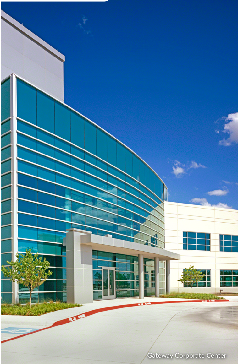
Gateway Corporate Center