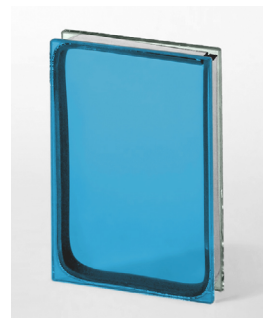
Solarcool® (2) Pacifica® + Solarban® 60 Glass