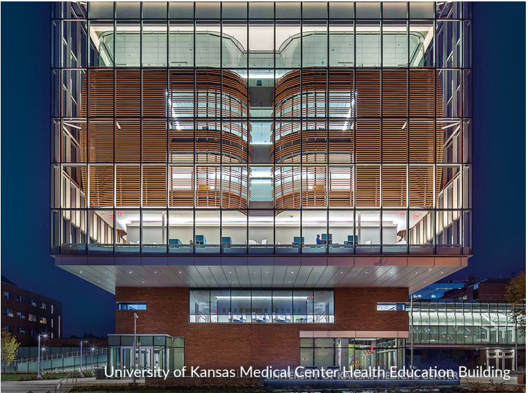
University of Kansas Medical Center Health Education Building