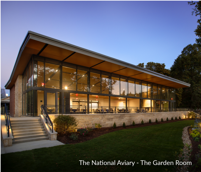
The National Aviary - The Garden Room