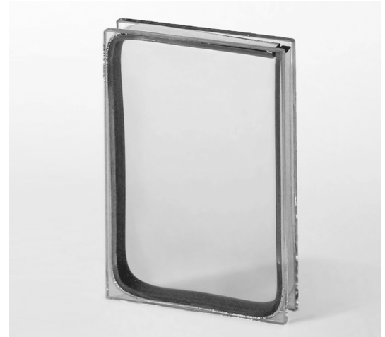
Starphire Ultra-Clear® Glass

To order samples, visit samples.vitroglazings.com