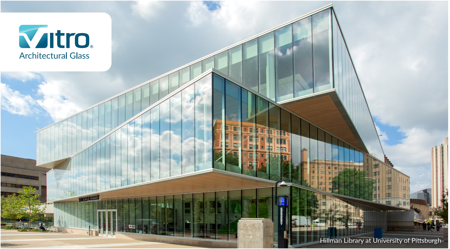
Hillman Library at University of Pittsburgh