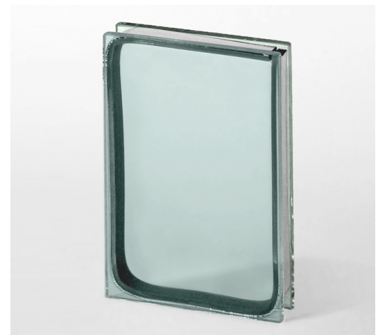
Solarban® 70 Glass

510 Vermont | Los Angeles, California | Solarban® 70 Glass | Architect: Gensler Glass Fabricator: Glassfab Tempering Services Inc. | Glazing Contractor: Walters & Wolf | Photographer: Tom Kessler