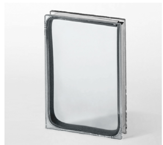
Solarban® 65 Starphire® Glass

To order samples, visit samples.vitroglazings.com