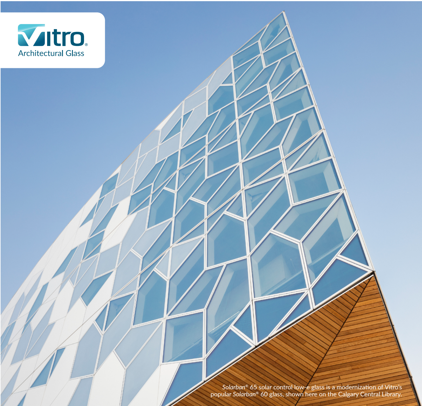
Solarban ® 65 solar control low-e glass is a modernization of Vitro's popular Solarban ® 60 glass, shown here on the Calgary Central Library.