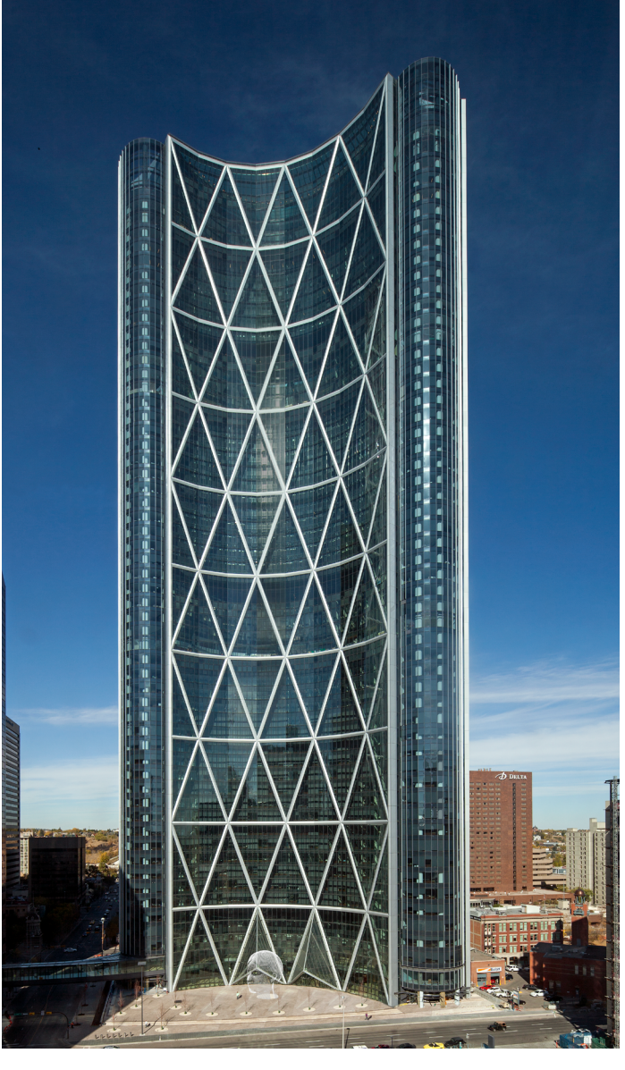
Location: Calgary, Alberta, Canada | Product: Solarban ® 60 Optiblue ® Glass | Design Architect: Foster + Partners | Vitro Certified ™ Fabricator: Oldcastle BuildingEnvelope | Glazier: Antamex

Consequently, Solarban <sup>®</sup> 60 Optiblue <sup>®</sup> glass may be better suited to climate zones that are more equally balanced between heating and cooling seasons.